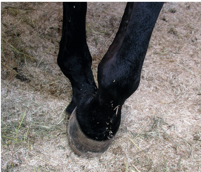
Diminished proprioception in a case of EHV-1 myeloencephalopathy