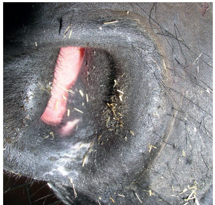
Nasal discharge in a case of EHV-1 rhinopneumonitis

The virus can be shed for up to 2–3 weeks after infection or reactivation. In cases of EHV-1 neurologic disease, the virus can be shed for an even longer period of time. Virus survival in the environment is estimated to be of about 14 days in most conditions.